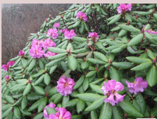
Rhododendron niveum Hook.f.